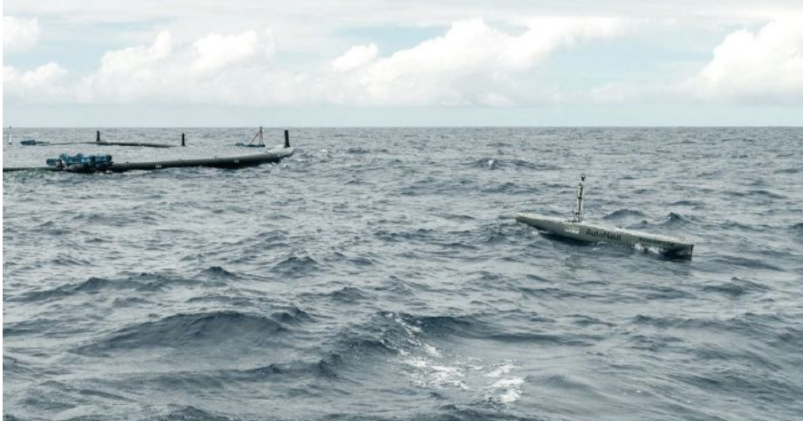
» AutoNaut USV conducting close-pass operations on The Ocean Cleanup system.

AutoNaut Unmanned Surface Vessels (USVs) have been collecting vital environmental monitoring data in the Great Pacific Garbage Patch in support of The Ocean Cleanup.